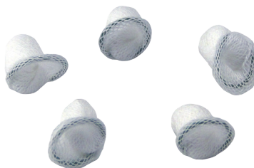
Secto ® Peanut Dissectors 81-1000