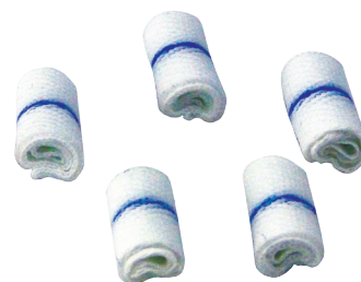
Secto ® Kittner Dissectors 81-1001