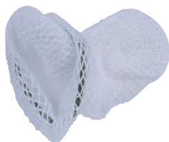
Secto ® Triangle Dissectors 81-1006